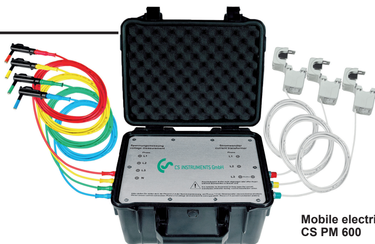
Mobile electricity/effective power meter CS PM 600