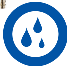
Pressure dew point