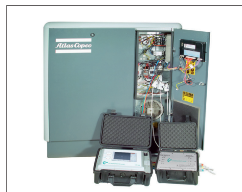
Example: Measurement on the compressor

All measured data are transferred digitally (Modbus) to DS 500 mobile/ DS 400 mobile and can be recorded there.