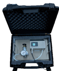
Compressed air quality measurement