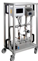
Compressed air quality measurement