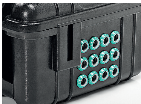
12 sensor inputs

Including voltage supply for all sensors