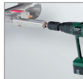
Drill under pressure with the CS drilling jig

3) Due to the large measuring range of the probe even extreme requirements to the consumption measurement (high volume flow in small pipe diameters) can be met.