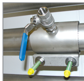
B Spot drilling collars