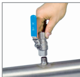
A Screw neck

By means of the drilling jig, it is possible to drill under pressure through the 1/2" ball valve into the existing pipe. The drilling chips are collected in a filter. Then install the probe as described under 1).